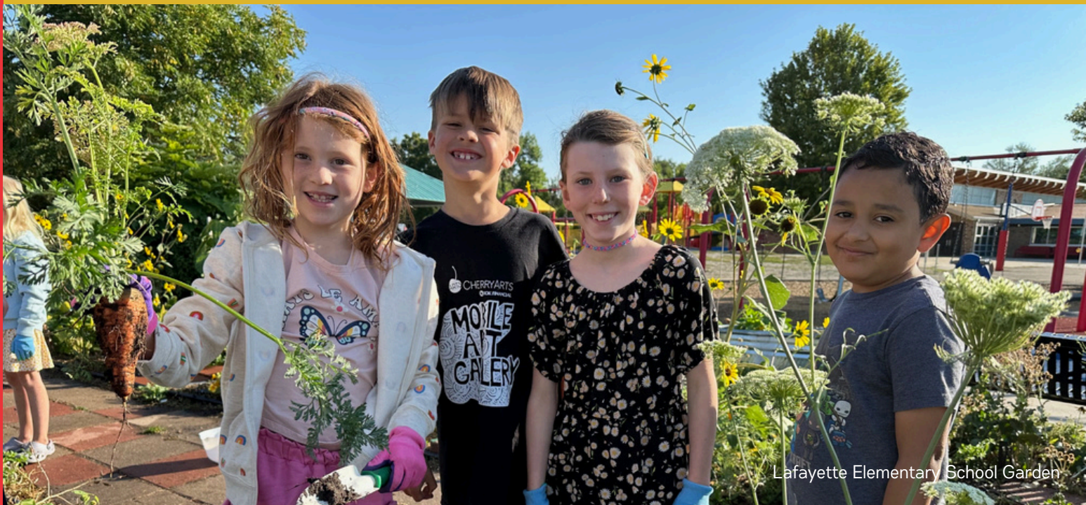
Lafayette Elementary School Garden